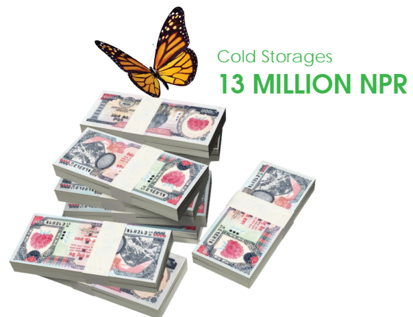
Figure 2: Monetary saving potential in Nepalese Cold Storage Sector (GIZ/NEEP, 2012 1 )